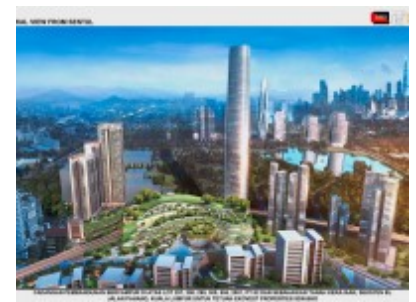
Bridging homes and public transport