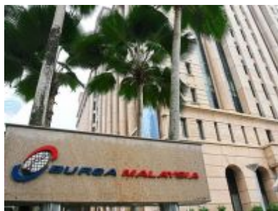
Trading ideas: Serba Dinamik, Pharamaniaga, IOI Properties...