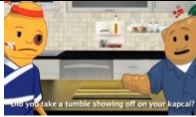
Heal your physical trauma with Tianqi root