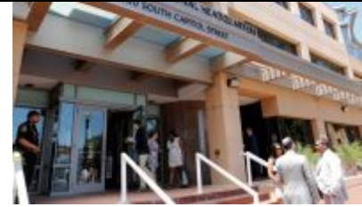
US inquiries into Russian election hacking include three...