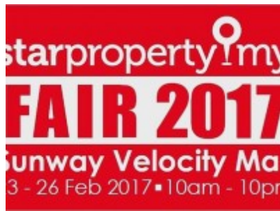
Property exhibition to hold its first expo this year at Velocity