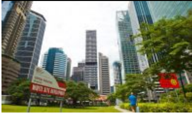
Strong results for IOI Prop in Q2