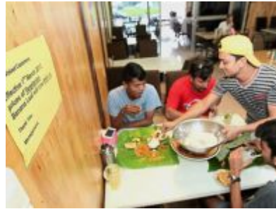
Costs get unbelievable