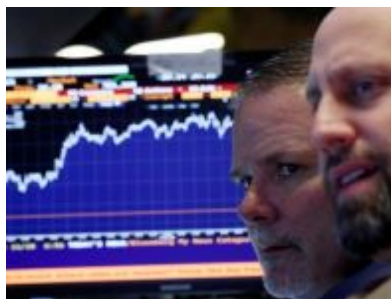
Global stocks hit record highs, US$ rises on rate-hike view